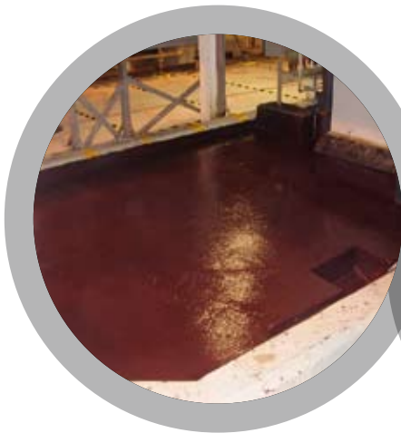
Chemical Containment Areas